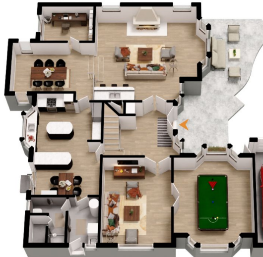
MAIN HOUSE GROUND FLOOR