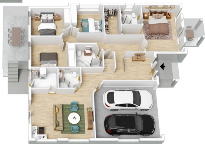
Ground Level/Lower Ground