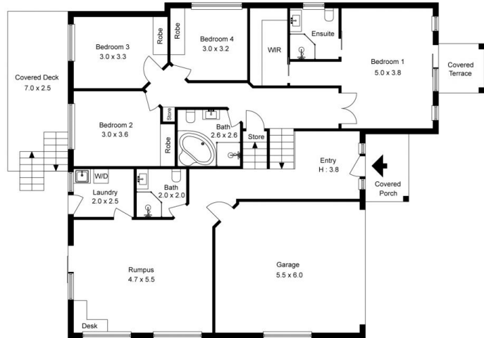
Ground Level/Lower Ground