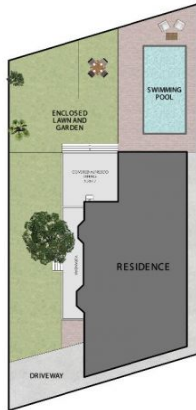
GENERAL SITE PLAN (NOT TO SAME SCALE)